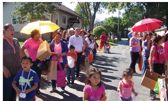
Families eagerly await the opening of the Mobile Food Pantry.

The Year of Service has afforded the Center the opportunity to share the story of its bountiful harvest with the public. Events have been reported on by local media. The Aurora City Council even bestowed a proclamation upon the Center, recognizing its tremendous impact on the community. Since its founding twenty years ago, about 2,500 students have improved their English skills at the Center and 1,000 students have prepared for citizenship. Congratulations to the Dominican Literacy Center and Happy Anniversary!